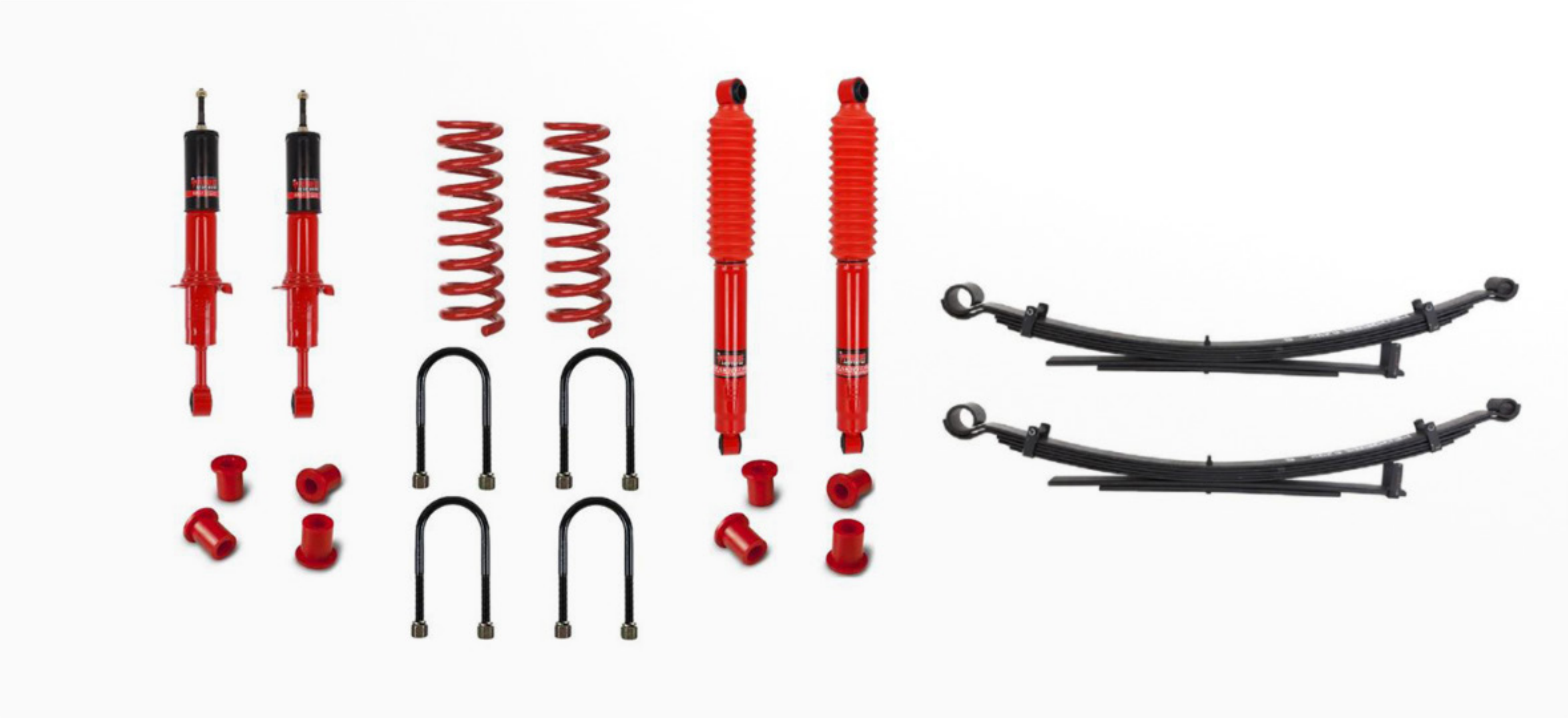
PEDDERS SUSPENSION LIFT KIT (30mm)