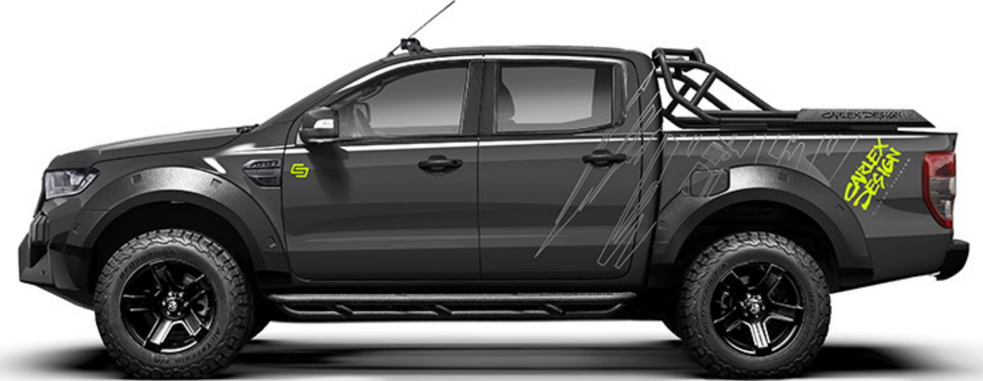
MICA SHADOW BLACK