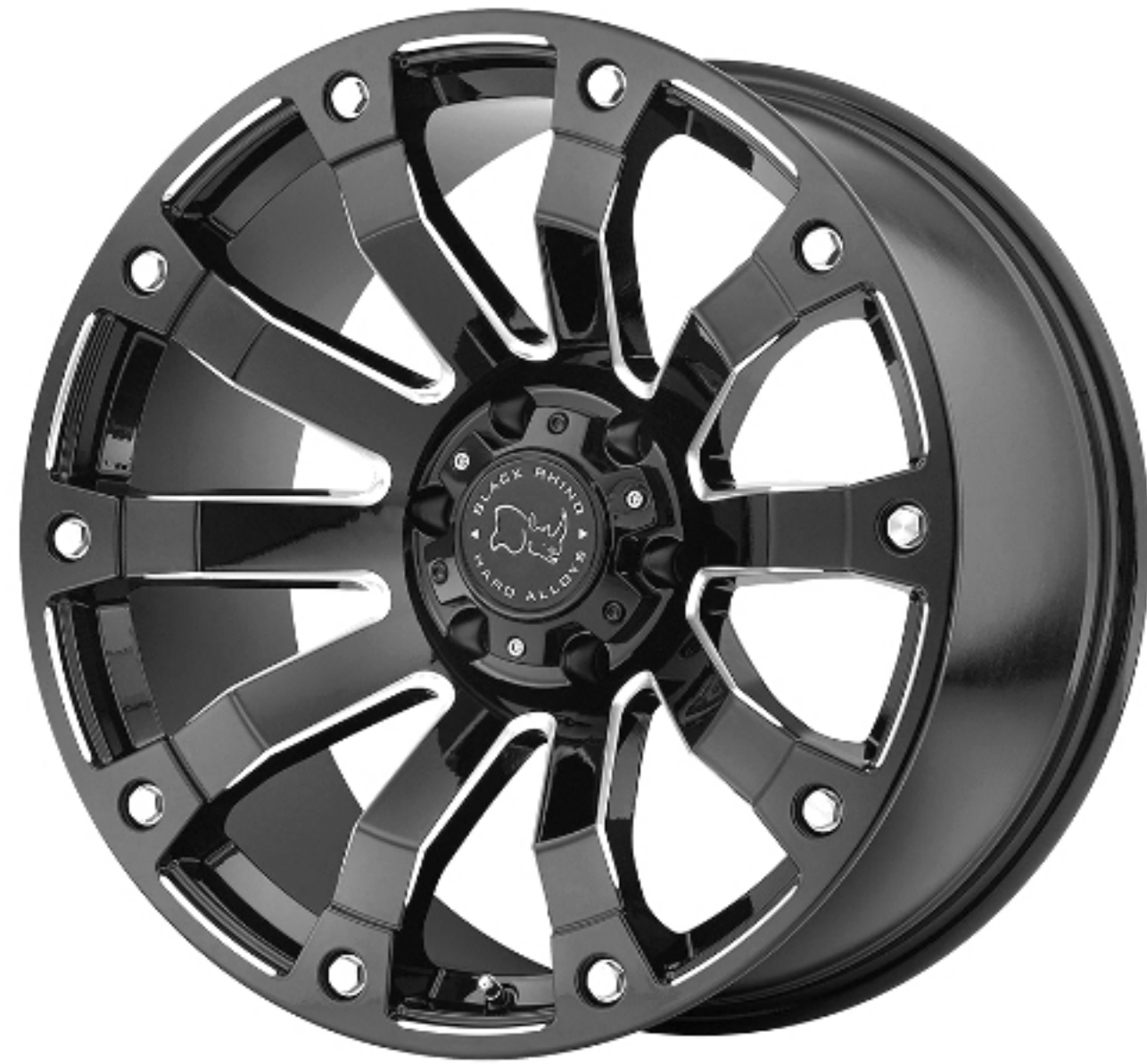
18" TSW BLACK RHINO SELKIRK RIMS