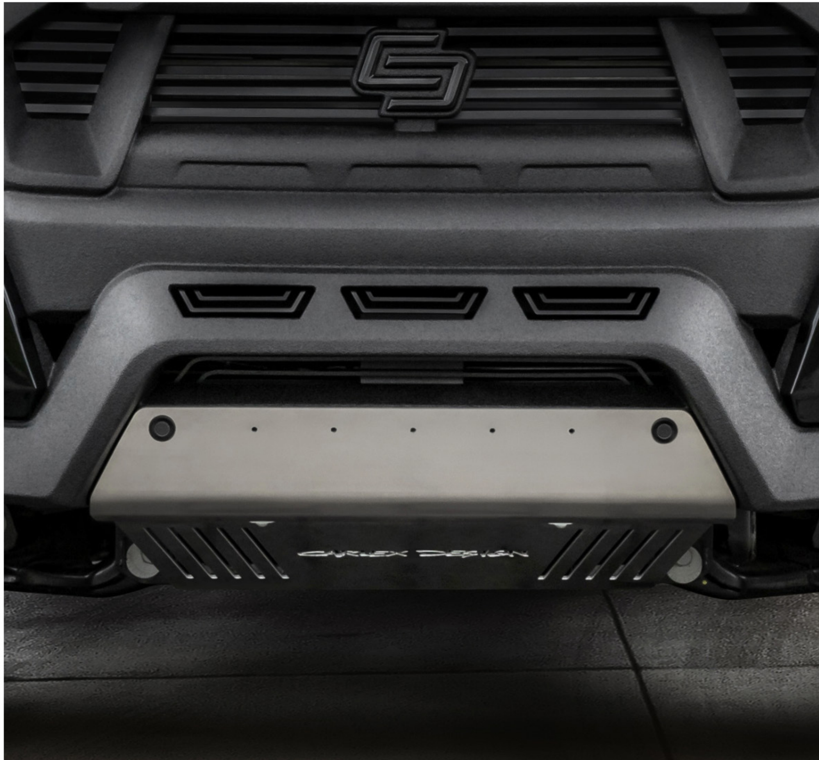
ALUMINIUM RADIATOR GUARD