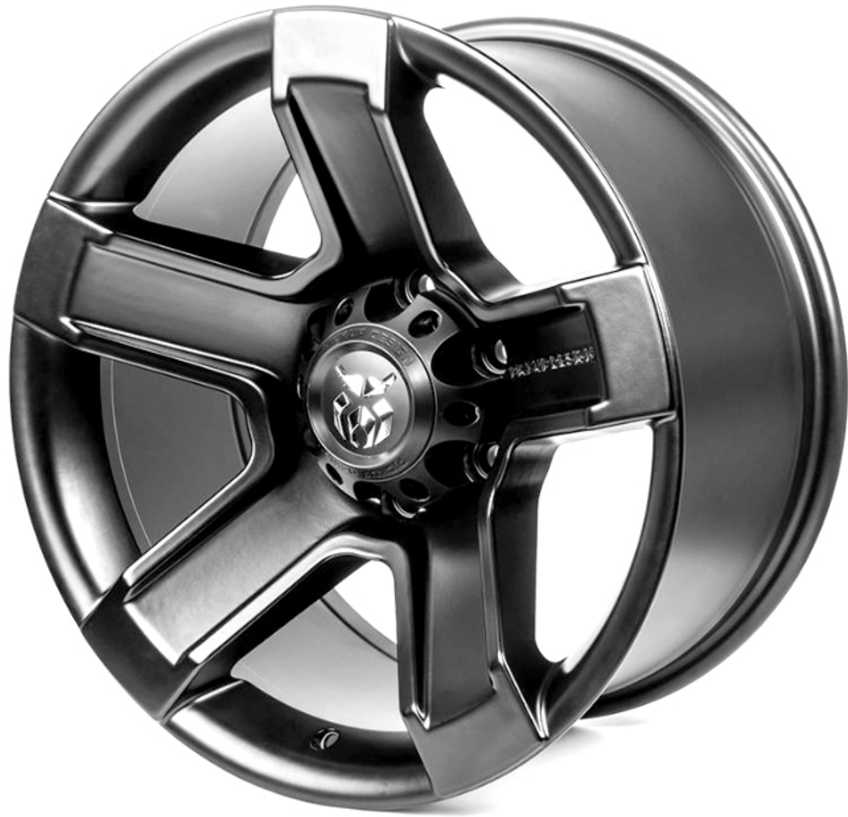
18" CARLEX DESIGN ALLOY WHEELS