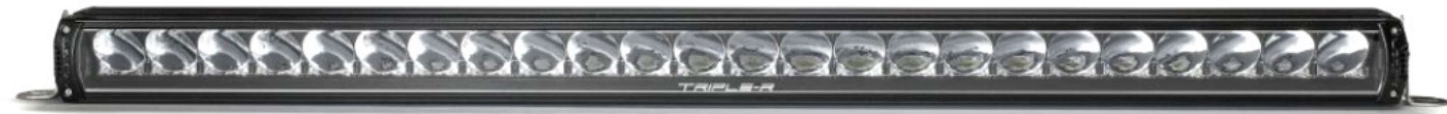
LAZER TRIPLE R 24