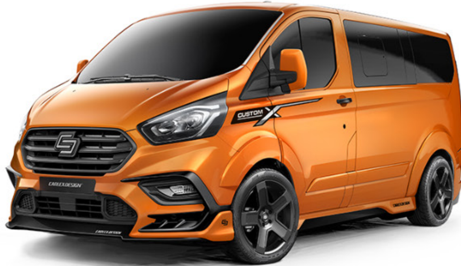
ORANGE GLOW METALLIC