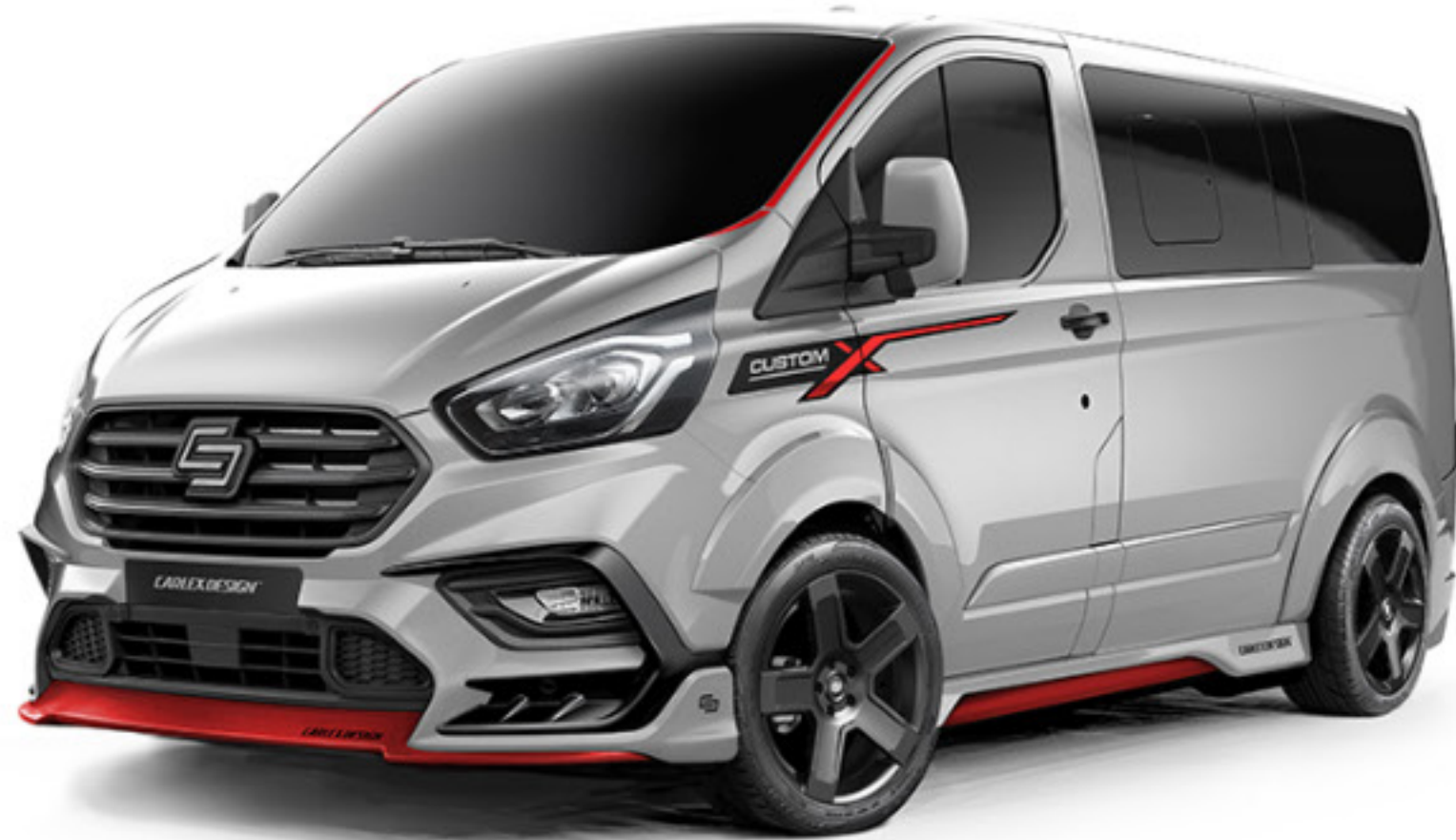
MOONDUST SILVER METALLIC