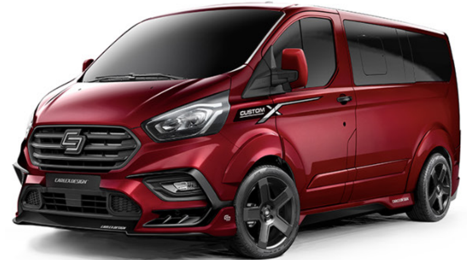
KAPOOR RED METALLIC