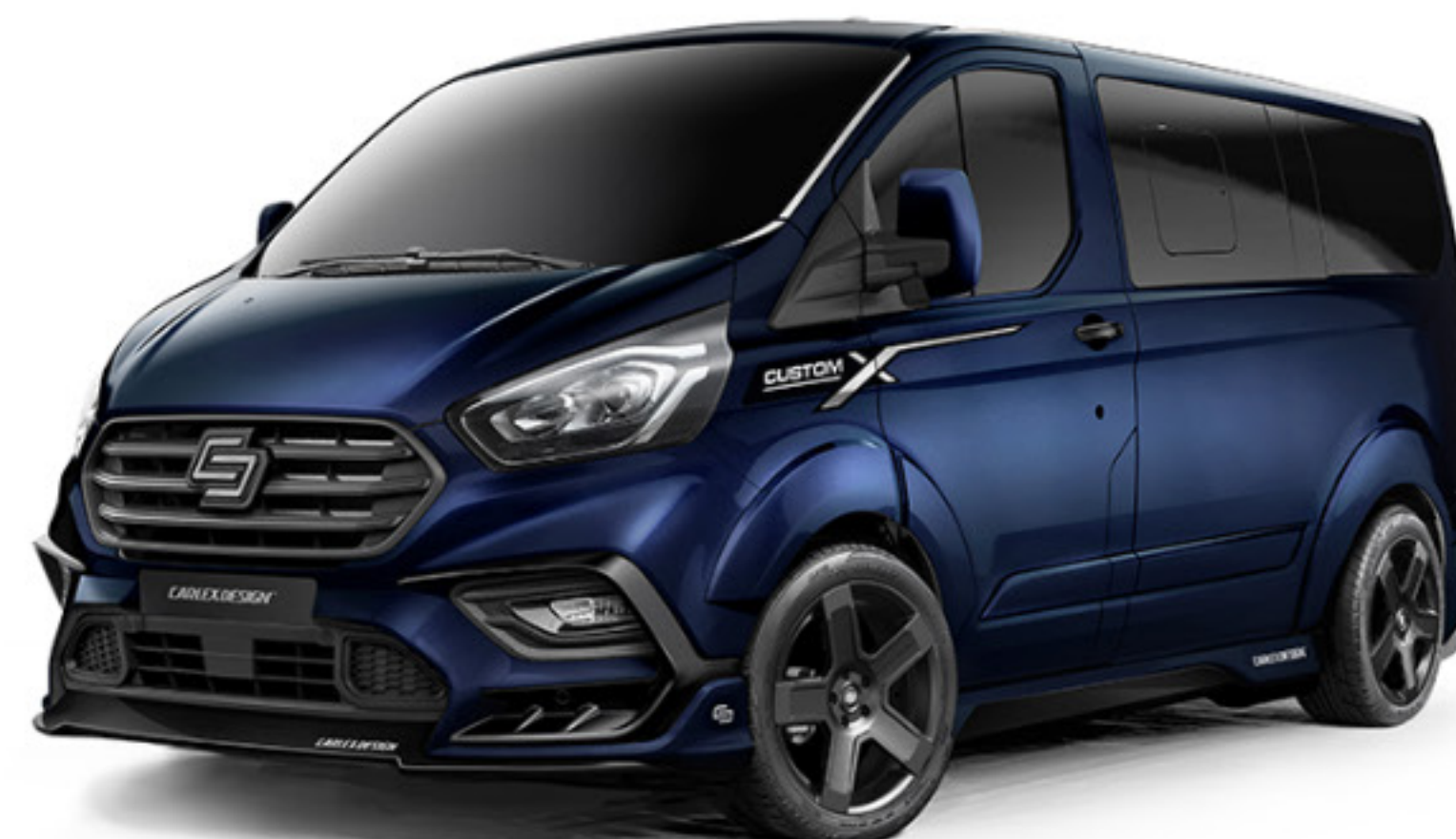
BLAZER BLUE METALLIC