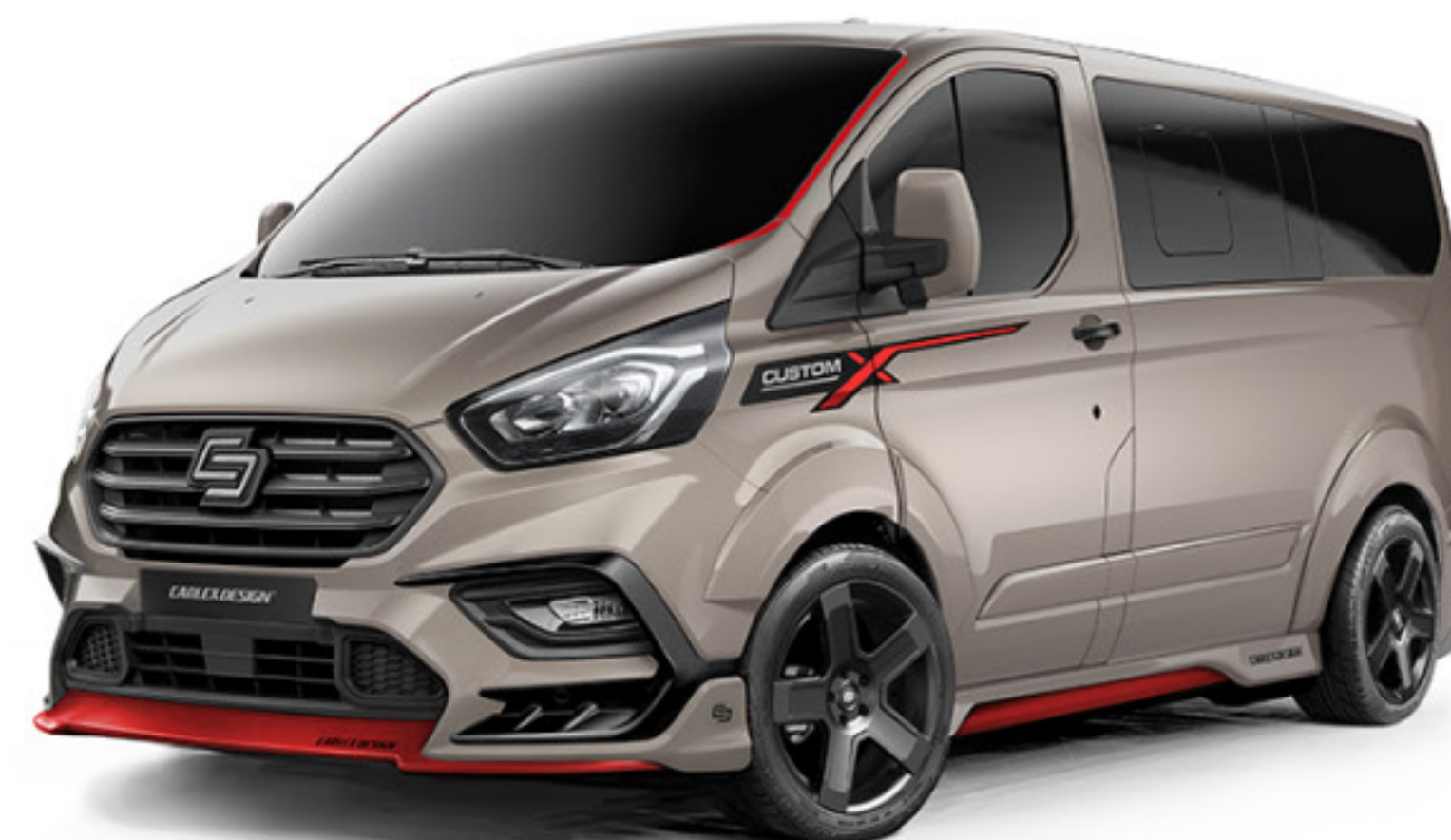
DIFFUSED SILVER METALLIC