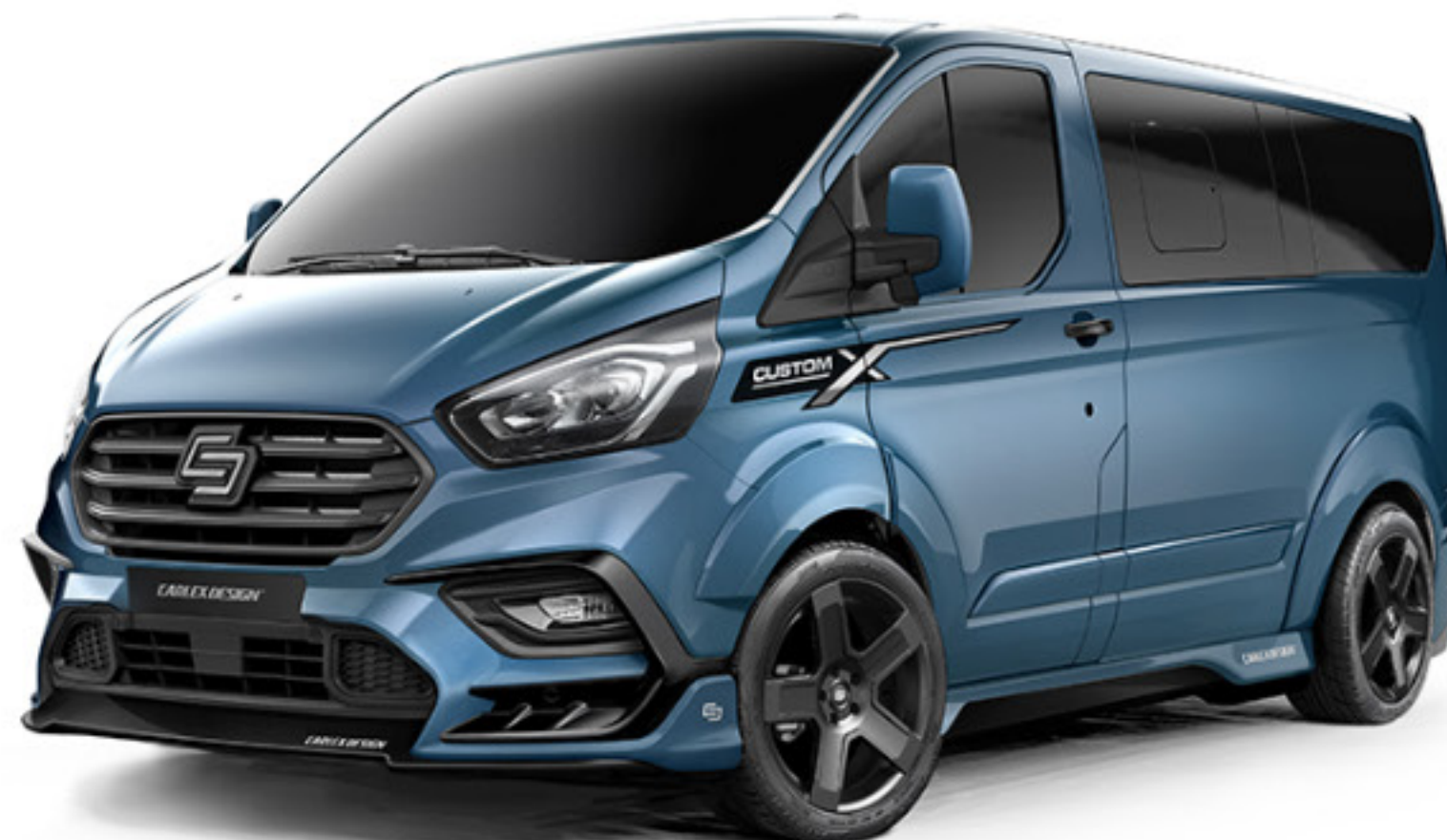
CHROME BLUE METALLIC