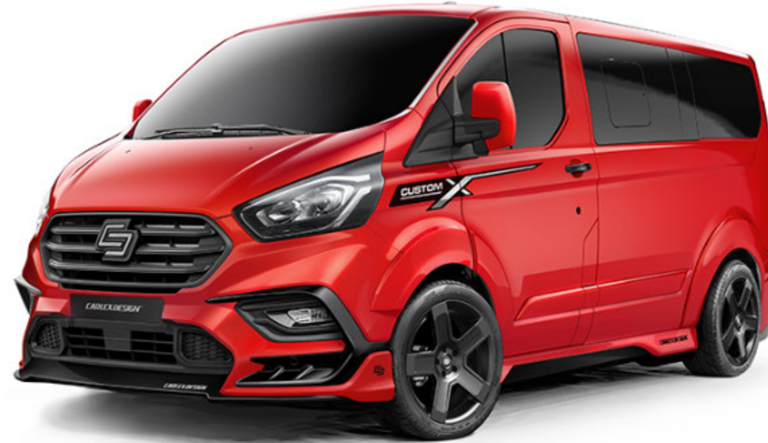
RACE RED METALLIC