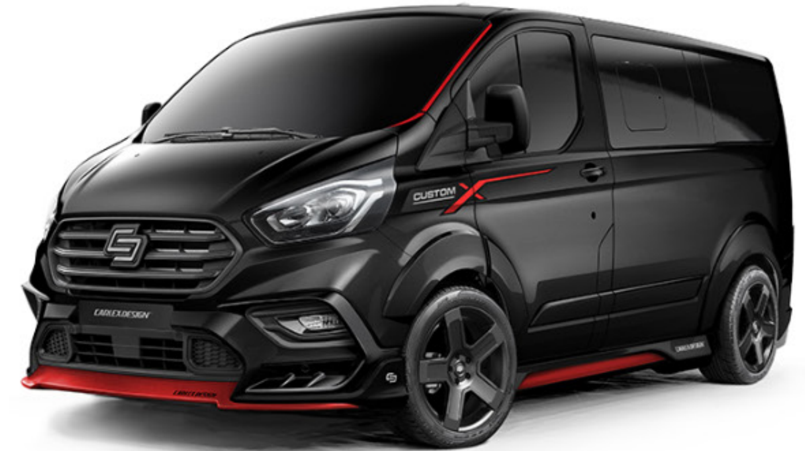
AGATE BLACK METALLIC